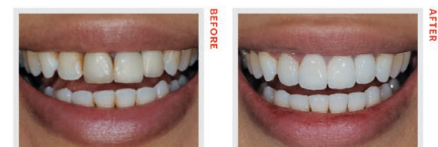
This 27-year-old patient sought Atlanta cosmetic dentist Ronald Goldstein, DDS to replace existing crowns and whiten teeth that were left with residual bonding material after the removal of orthodontic brackets.